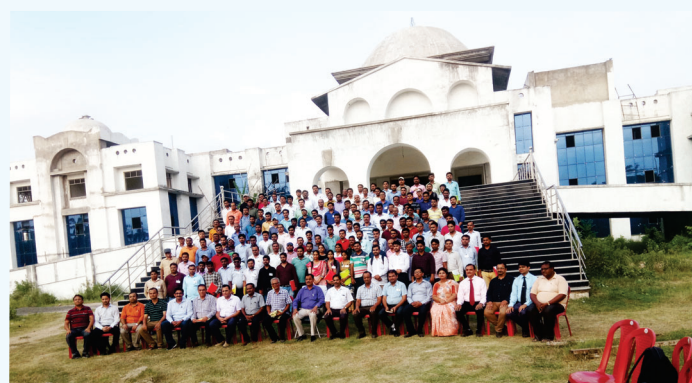
ToT at BAU Sabour

It is expected that the second green revolution of our country will be from the eastern region of India and Bihar will be the hub of it. Bihar Skill Development Mission (BSDM) has started their batches of training under state skill development mission scheme and they have included 34 Agricultural Job Roles. ASCI has successfully conducted a 10 days Training of Trainers for the record 203 Participants for 10 job roles at Bihar Agricultural University, Sabour in 2018 which is one of the biggest ToT.