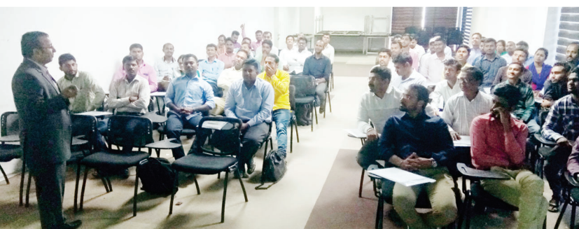
ToT at Pune