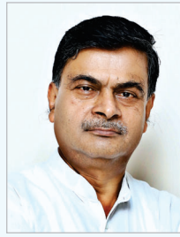
Dr. Mahendra Nath Pandey Hon'ble Minister Ministry of Skill Development & Entrepreneurship (MSDE)

"We have seen great potential, great energy & enthusiasm in the youth of the country & how they are adapting to new age skills, transforming their lives & contributing to the new India. If the program has been able to transform lives, it is because of the passion & grit with which the youth is participating in it. We are working closely with the States, Department and Industry to ensure a robust skill ecosystem which would empower the youth and create opportunities of employment for them"