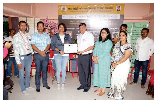
ASCI created India & Asia Book of record