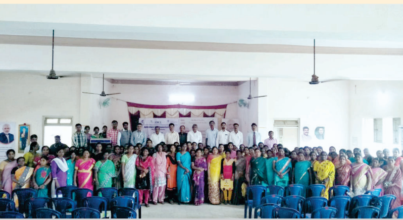
Rozgar Mela at Maddur