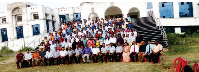
ToT at BAU Sabour

ASCI organizes Training of Trainers (ToT) and Training of Master Trainers (ToMT) Programs on a regular basis for various job roles across different geographical regions aiming to improve training delivery skills in the sector of their preference in alignment with NSQF