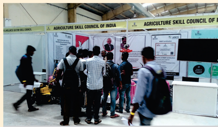
Rozgar Mela at Balasore