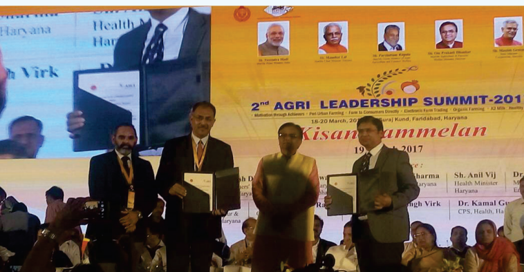
MoU signed between ASCI and Haryana Horticulture Dept.