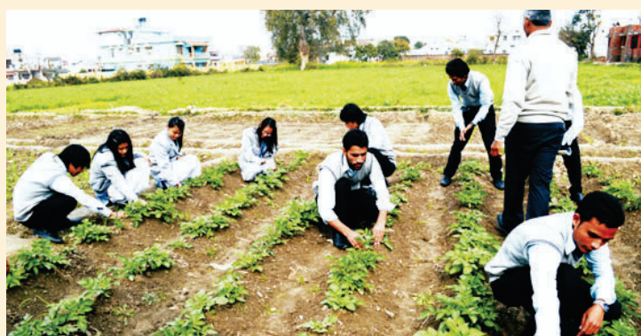
Training at School

In Maharashtra, Agriculture got introduced in 30 new schools apart from Multi Skill Programs which is going on in 228 schools which sums up to 258 Schools.