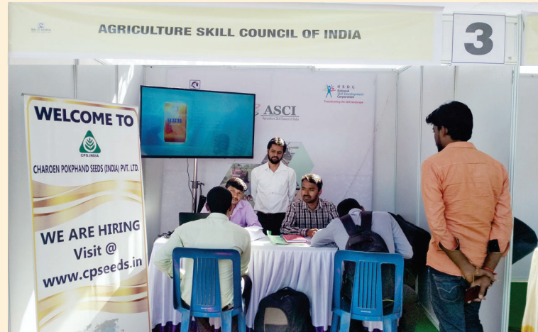
Rozgar Mela, Belgaum