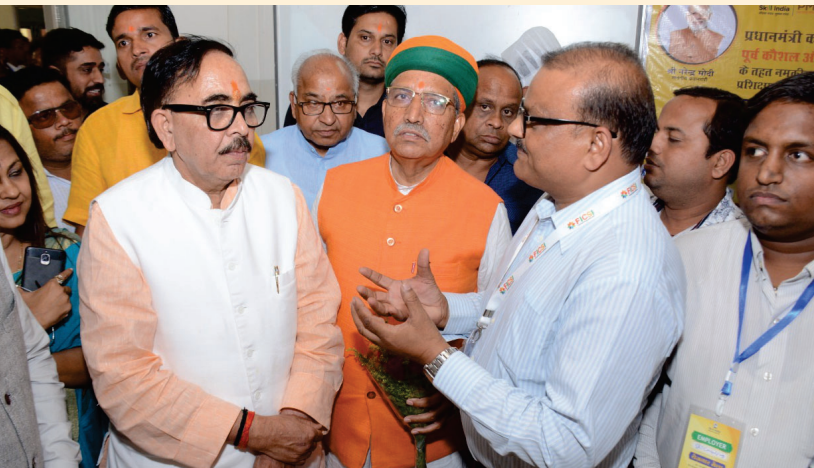
Rozgar Mela, Bikaner

Apart from this, ASCI also conducts standalone Job Melas in different parts of the country. Employers from Agriculture and allied sectors participate in Job Fair and undertake the placement process. Few companies who have participated are Coromandel International Pvt. Ltd., DCM Shriram, ICICI Lombard, Coromandel Agrico Pvt. Ltd., Shivshakti Biotechnology Ltd., Navbharat Fertilizers Ltd., Jaykishan Horticulture Ltd., Ananda Dairy, KisanKraft, Escorts Crop Solutions & Women Organization For Socio Cultural Awareness, National Collateral Management Services Limited, Willo Wood Crop science Pvt. Ltd., Gramophone.