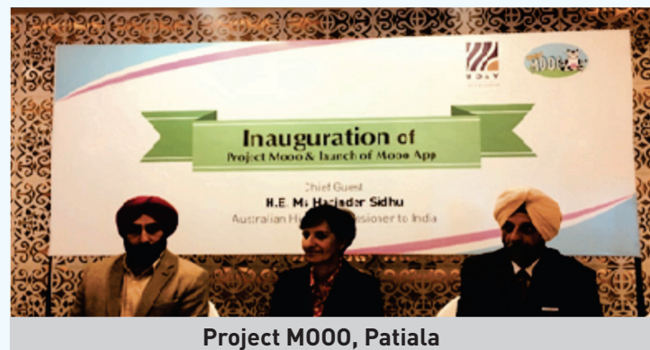
Project M000, Patiala

A major initiative has happened in Haryana wherein a MoU was signed with Haryana Horticulture Dept. & seven training centers. Agriculture as a vocational subject is being taught in 108 schools & assessment of 3,352 students in these schools were conducted.