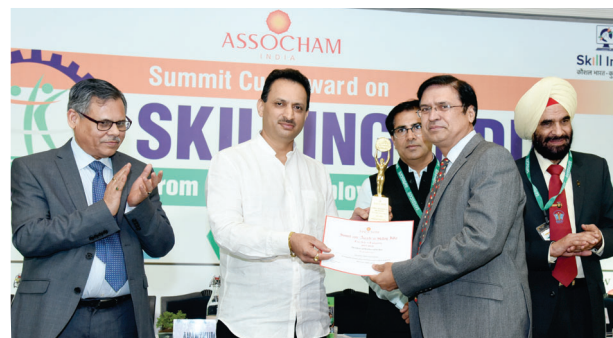
CEO ASCI receiving the best SSC award